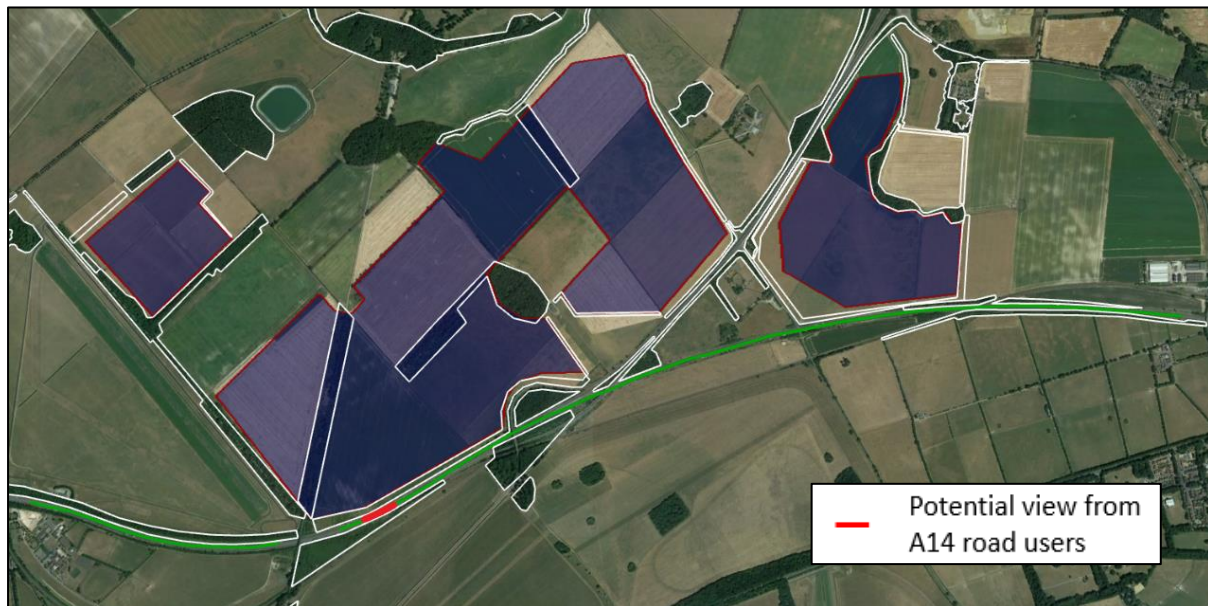
Plate 16-1 Potential for glint and glare from A14 for road users traveling in a south-westerly direction